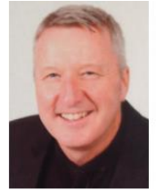
Deputy Designated Safeguarding Lead