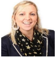
Designated Safeguarding Lead